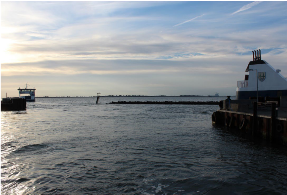
Local ferries and a coaster in the Great Belt, Denmark

Urban and Industrial uses - Society's need for trade and movement of goods, stable economies, industrial processes, materials, and health and well-being are drivers of industrial uses. Industrial atmospheric emissions and direct discharges into the sea can lead to the input of substances into the environment, and long-range transport can be a major contributor to the North Sea area. In the OSPAR area, as well as globally, discharges of substances like PAHs and PCBs from industry into the air and sea have been strongly reduced during recent decades.