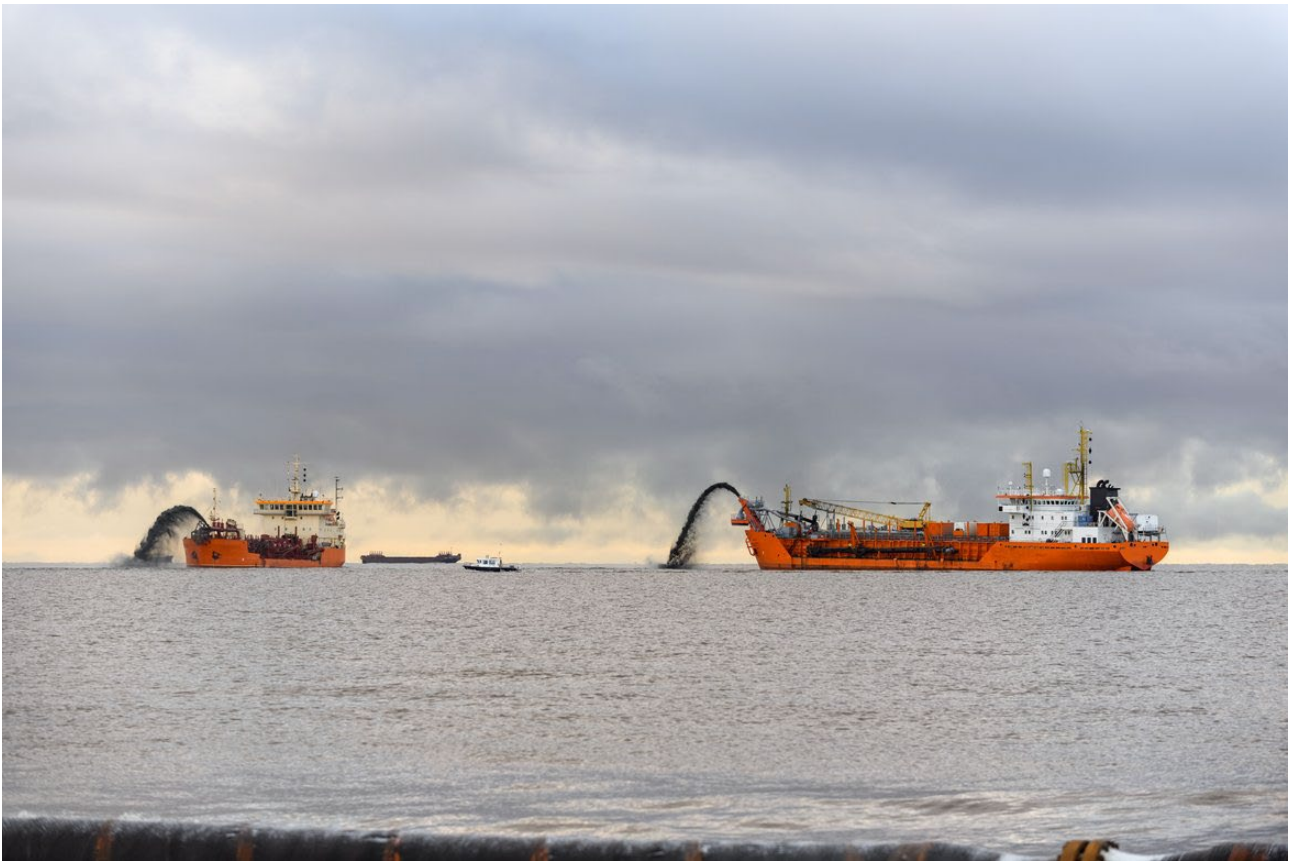
Two vessels engaged in dredging.

Non-renewable energy generation: Coal combustion in power plants is the most important source of atmospheric mercury, making up 65% of all anthropogenic mercury emissions to the atmosphere. For the entire OSPAR area combined, atmospheric mercury dominates the input of mercury into the ocean . This and other sectors like refineries and iron mills also discharge other heavy metals such as nickel, vanadium, arsenic, lead, selenium, chromium, and cadmium.