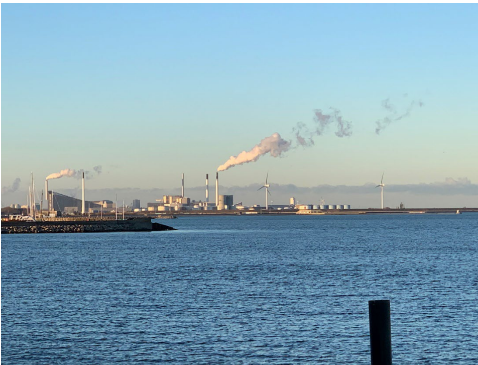
Image A.2: The “Prøvestenen” oil depot south of Copenhagen Harbour. In 2008, a 200 m 3 oil spill from a broken transfer line, covering an area of 400x500m, threatened the beaches in both Copenhagen and Malmö, but was contained by Danish and Swedish anti-oil pollution vessels.

Ships and leisure boats also use antifoulant paint to reduce biofouling (growth of marine organisms on the hull). While the use of tributyltin as an antifoulant is now banned, current antifoulants typically contain copper, and account for a substantial part of the input of that metal into the marine environment. Corrosion anodes are typically made of zinc with trace impurities of cadmium and lead.