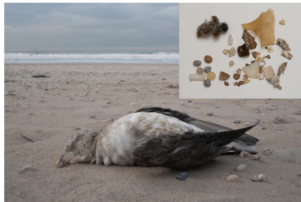
Image: Beached fulmar © JA van Franeker Inset: Plastics from a fulmar stomach © JA van Franeker

The OSPAR Common Indicator on Plastic Particles in Fulmar Stomachs aims to reflect litter floating at the surface, and the potential harm from marine litter in the North Sea environment to pelagic (open sea) marine organisms. However, the fulmar monitoring effort does not give direct information on ‘harm’ or ‘damage’ but simply quantifies spatial and temporal patterns in abundance of plastics in fulmar stomachs as an indirect measure of harm. Dedicated experimental laboratory-based research into evidence of harm to fulmars from specified levels and types of plastics, as a specific example of harm, is urgently needed to strengthen the role of the OSPAR Common Indicator.